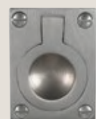
5177 | 40 x 33mm 5154 | 50 x 37mm