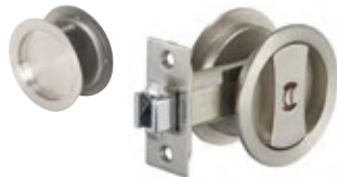
5326 | Passage Kit 5327 | Privacy Kit