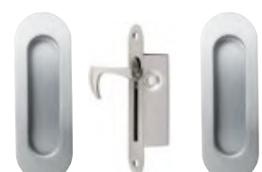
5260 Oval Style 102 x 120mm SS Also available as lock kits