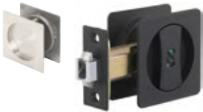
5330 | Passage Kit 5331 | Privacy Kit