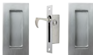
5261 Square Style 102 x 51mm SS Also available as lock kits